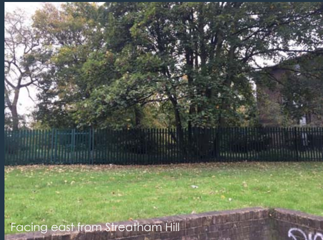
Facing east from Streatham Hill

GVA St Catherines Court, Berkeley Place, Bristol BS8 1BQ GVA is the trading name of GVA Grimley Limited an Apleona company. ©2017 GVA