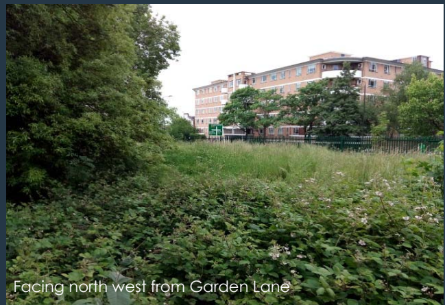
Facing north west from Garden Lane